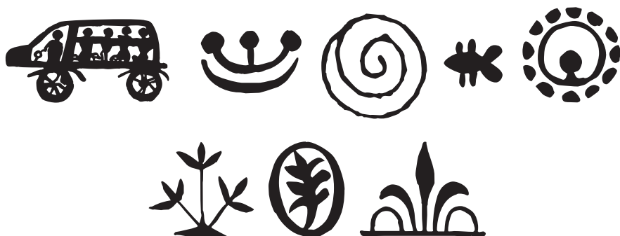
Xiquets Afrotibet 64pt