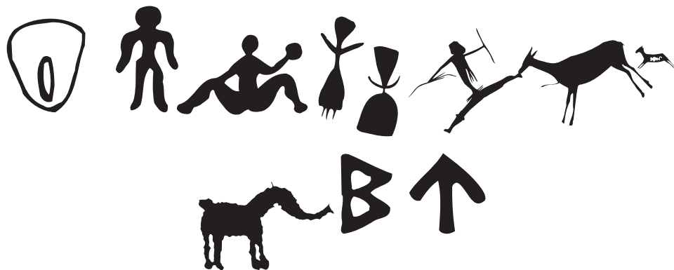
Xiquets Primitives 64pt