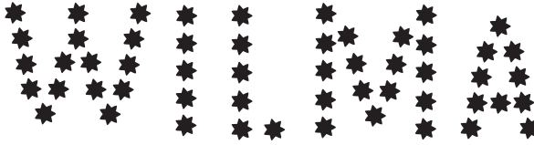
Wilma Motiu B 80pt