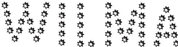
Wilma Motiu Forat B 80pt