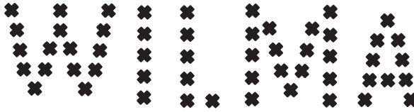
Wilma Motiu C 80pt